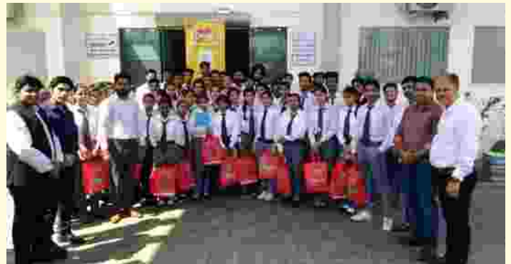
Industrial visit at Devarpan Food Product Co., Kashipur

Being a part of course curriculum of the management, IT & Commerce programmes. Industrial visits are arranged from time to time to provide industrial exposure to the students. To make them aware about practical knowledge of manufacturing of various kinds of food products like chips etc., an industrial visit was organized to Devarpan Food Product Co. (A Unit of KVS Group), Kashipur on 9th March 2018.