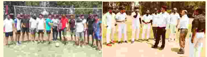
Inauguration of Annual Sports Meet 'Extravaganza'