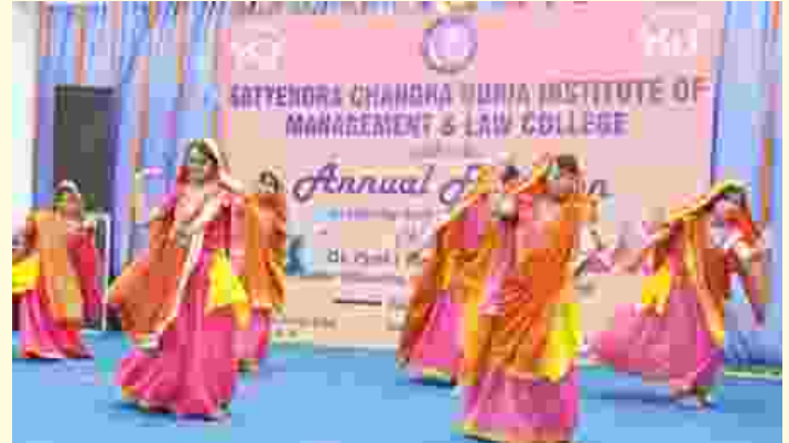
Performing Folk Dance by the students