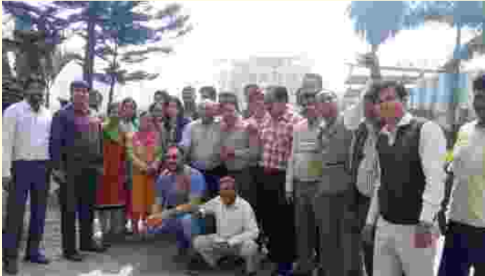
Holi Celebration at SCG IMT Campus

It was a fun and exciting Holi celebration where everyone had the best time and enjoyed to the fullest.