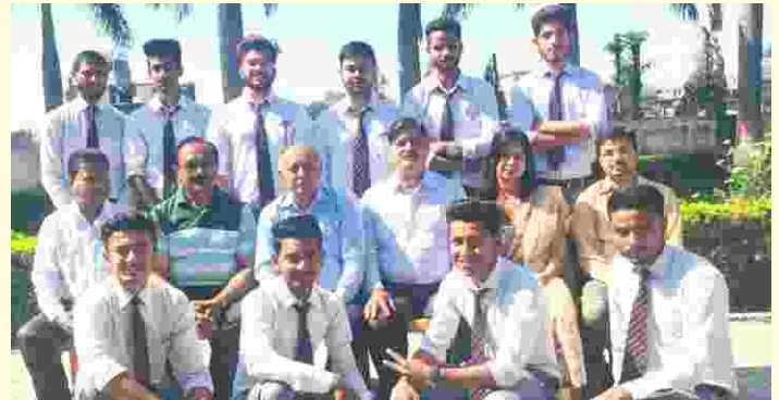
Cricket Team of SCG IMT with their coach and faculty members

Our team participate in DIT Univeristy, Dehradun Cricket Tournament 2018. Our players displayed their Cricketing Skills and reach the semi final. However they could not make it to the final. But they are full of enthusiasm to rectify their mistakes and confident to bring the trophy next year.