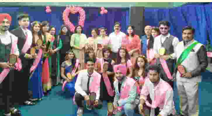
Winners of Ms. & Mr. Farewell 2018 with Guests

The institute organized grand farewell to bid goodbye to the students of MBA 2016-18 batch on 26th May 2018 as well as to the students of LLB, BBA & BCA 2015-18 batch.