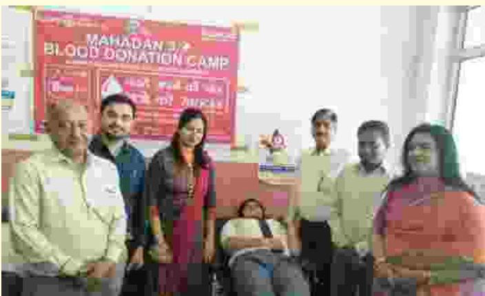
Blood donar with guest and SCG IMT faculty