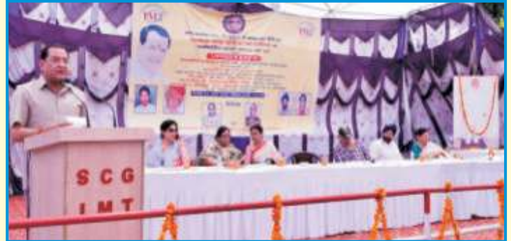
Address by Hon'ble Yashpal Arya Ji