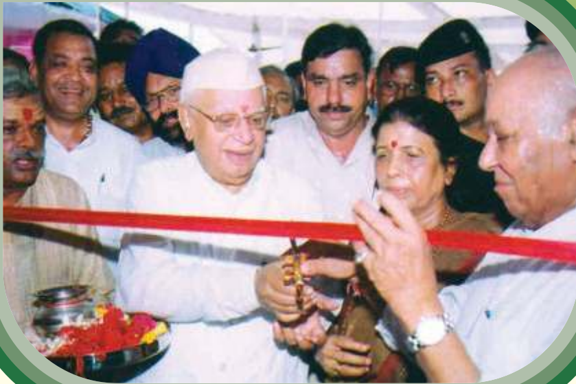
Inauguration by : Late Shri. N.D. Tiwari (Chief Minister, Uttarakhand)

About Us We take the pleasure to introduce ourselves as an upcoming institute in the field of management, computer & law education and are managed by a society which has an experience of number of years in imparting the education.