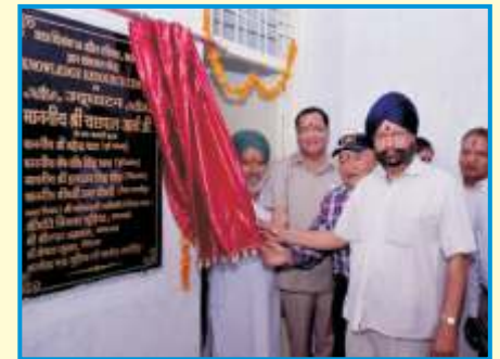
Inauguration of Knowledge Resource Center