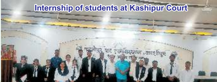
Internship of students at Kashipur Court