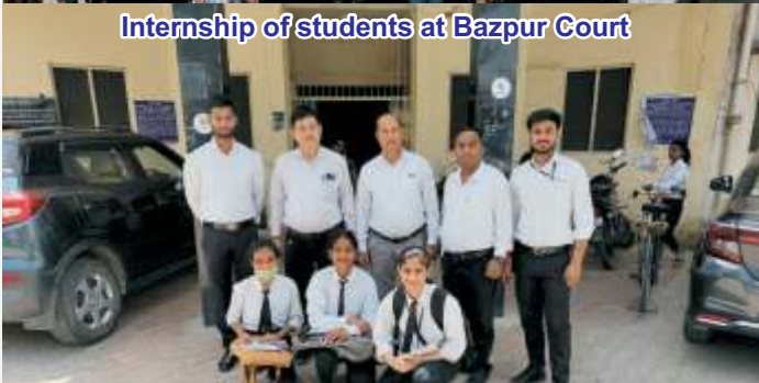
Internship of students at Bazpur Court