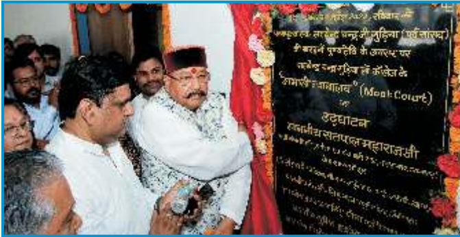
Inauguration of Moot Court by Hon'ble Satpal Maharaj Ji