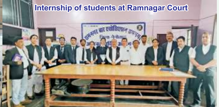
Internship of students at Ramnagar Court